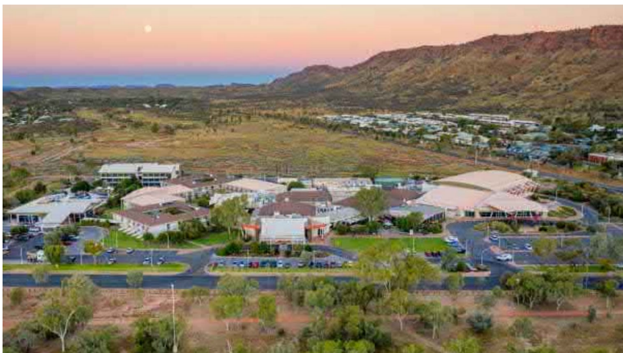
Figure 3: Elevated view of site from Barrett Drive