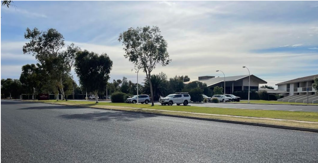
Figure 5: Existing Hotel and parking off Barrett Drive