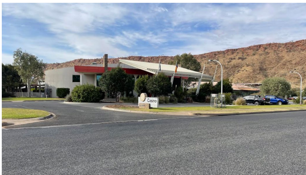
Figure 4: Existing entrance off Barrett Drive