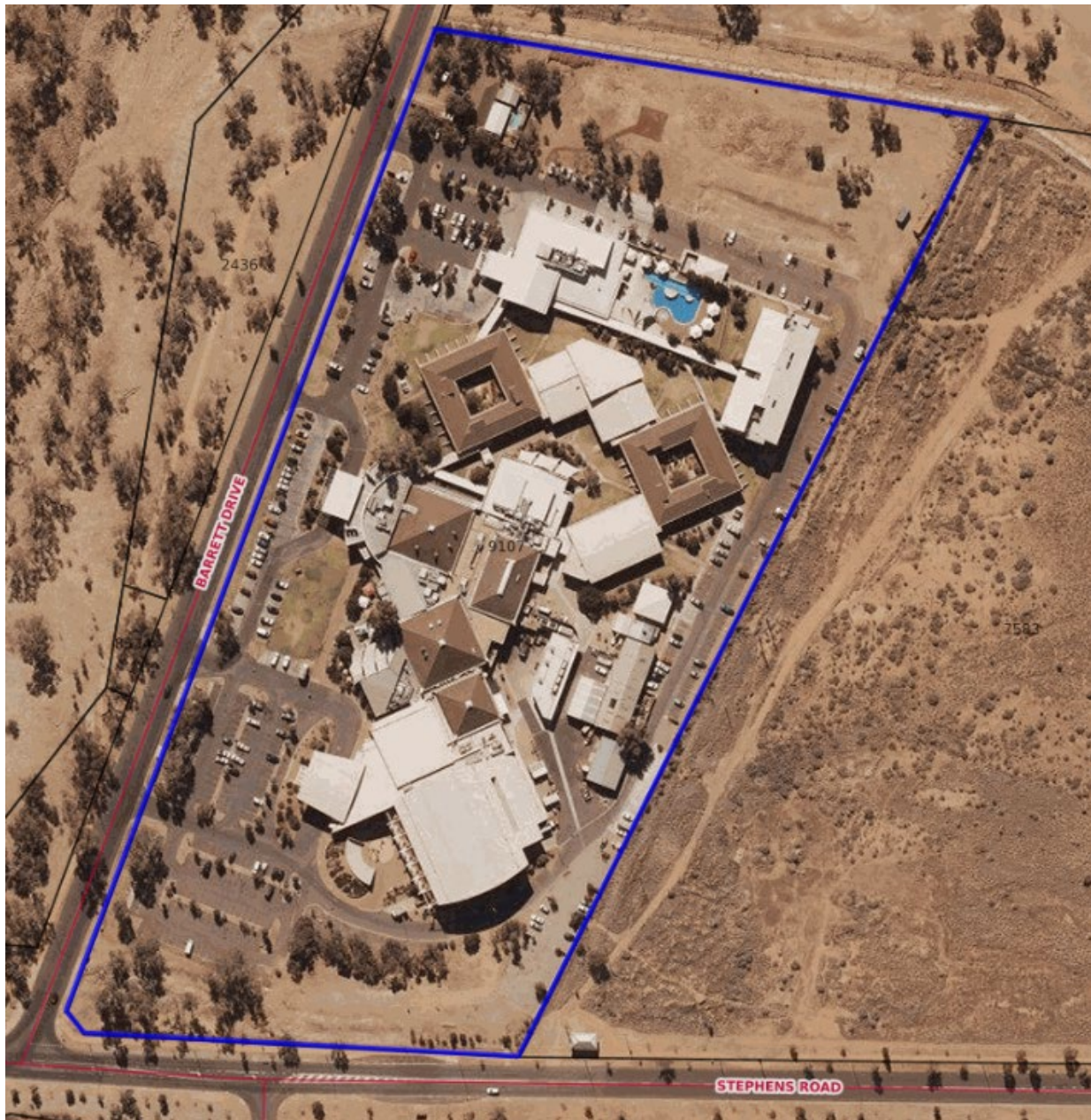
Figure 2: Aerial Image of Subject Land

The subject site is described as Lot 9107 (122) Barrett Drive, Alice Springs and contained within Zone TC (Tourist Commercial) under the NT Planning Scheme. The site has an area of 7.96 ha and contains an existing Alice Springs Lasseters Resort approved via a range of Historical Development Permits. The site and existing uses are accessed via four (4) existing crossovers and sealed access to Barrett Drive along the western boundary of the site.